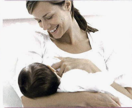
Worry about it being saggy when breastfeeding