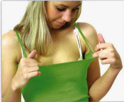
Dissatisfied with breasts size

However, women are still faced with problems related to breasts, such as: